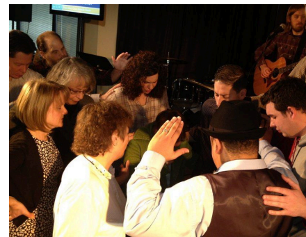
Rocksiders Pray for the Launch of Mosaic Community Church

“Therefore go and make disciples in all nations...and I am with you always, even to the end.” Matt. 28:19-20