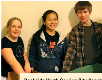
Rockside Youth Serving City Reach