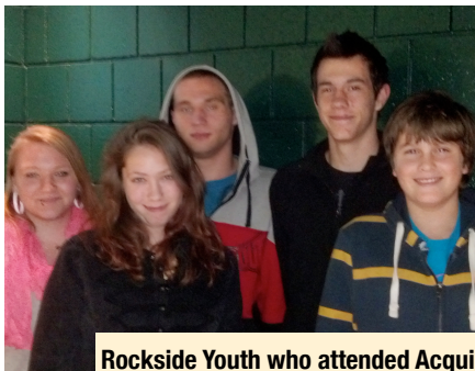
Rockside Youth who attended Acquire the Fire with Pastor Caleb